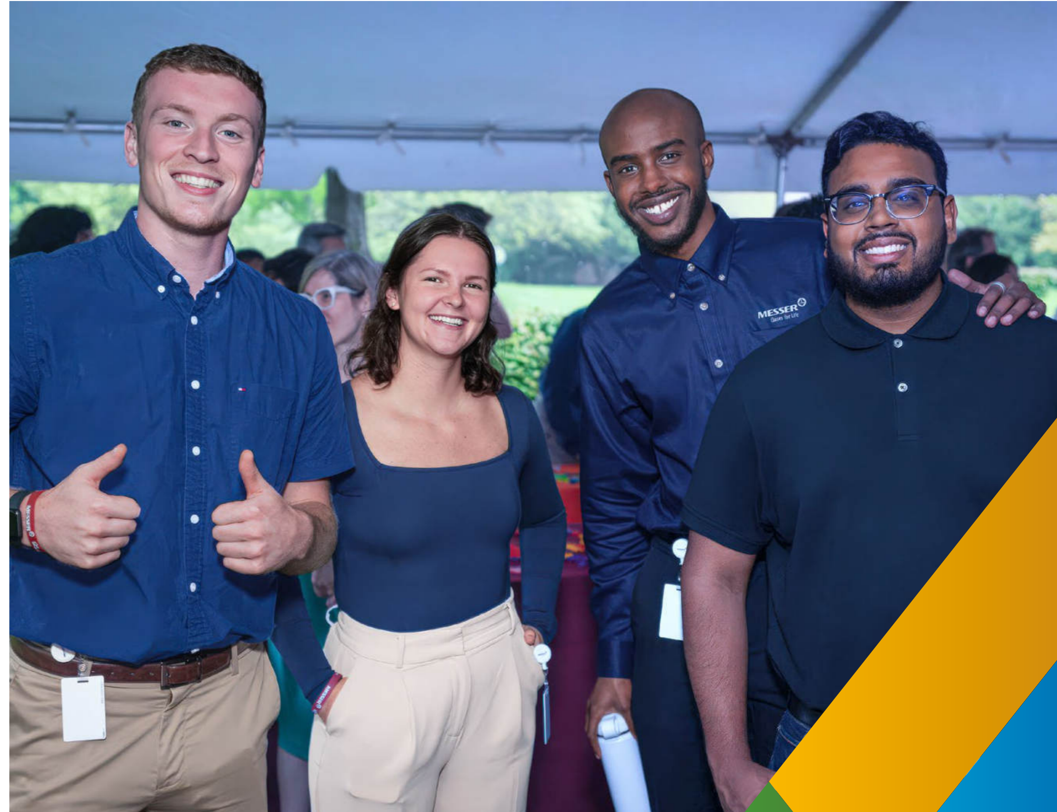
Messer in the USA

Air is a mixture of gases mainly composed of nitrogen (78%), oxygen (21%) and the inert gas argon (0.9%). The remaining 0.1% is made up mostly of carbon dioxide and the inert gases neon, helium, krypton, and xenon. A significant portion of our business is air gases. Air is typically separated into its components by means of distillation in air separation plants employing cryogenic rectification. This process is fully electrified, and our energy requirements are thus substantial. We carefully monitor and manage electricity consumption and sources for our production process. The decomposition of ambient air into its constituent parts does not produce any toxic or environmentally harmful emissions, even in the case