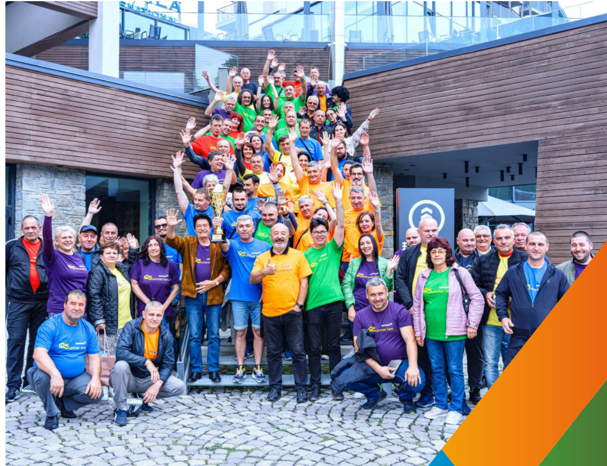
Messer in Bulgaria and North Macedonia

Messer is continuously expanding its range of customer-oriented digital tools. These simplify routines, facilitate work processes, and provide targeted information. Examples of this are the e-services that Messer offers its customers. They range from ordering/reordering, stock management and invoicing to product or application-specific information and applications that can be used to handle feedback and technical questions. In addition, digital technologies are used to optimize customer care.