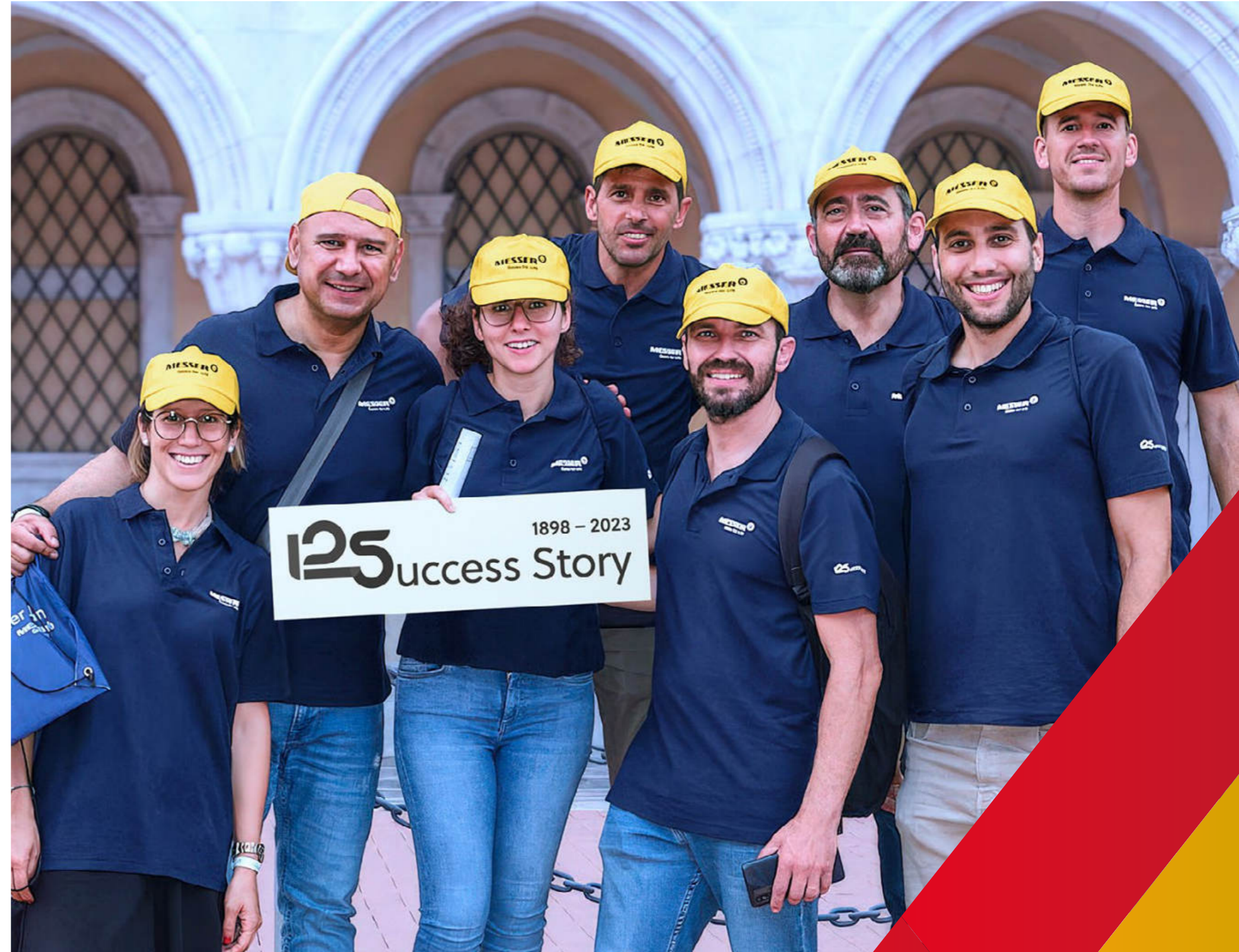
Messer in Spain and Portugal

In this report, we look at individual campaigns.