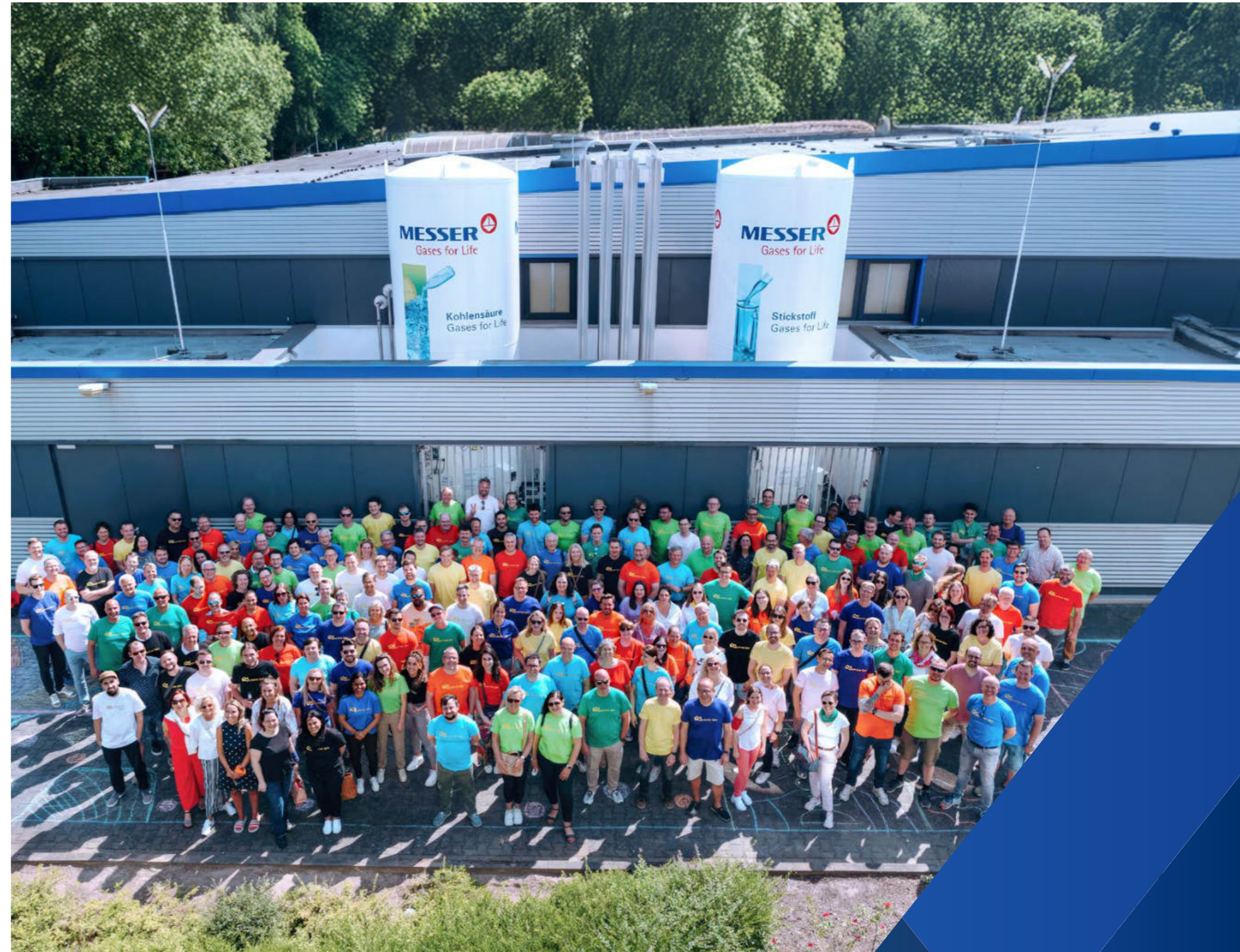
Messer in Germany

In 2023 a new risk management policy and process was established at Messer - derived from the requirements of ISO 31000:2018 Guidelines. The global Risk Management System includes a regular risk reporting to the Messer Executive Management Board and Supervisory Board in order that material risks may be actively managed. Risks (and opportunities) are categorized under “sustainability” if they relate to the anchoring of sustainability objectives or targets within the company, or to impacts on stakeholders.